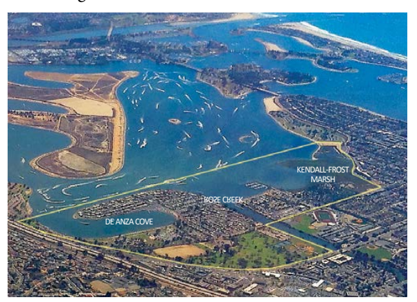
The yellow line marks the boundary for either plan.

doesn't include the regional parkland and active recreation area in the plan, one of the ReWild Coalition members, Citizens Coordinate for Century 3, created a plan that does include that area, showcasing how camping and many of the recreation opportunities included in the City's plan could coexist with the Wildest plan's wetland restoration configuration.