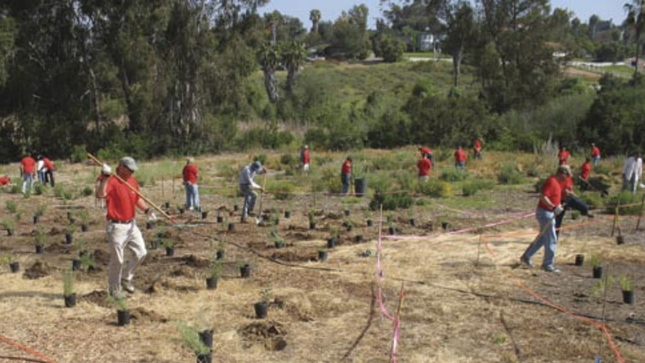
Above: A group of hard-working volunteers help replant an open field with native plants. Below left: Black Phoebe.